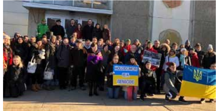
Ukrainian Students' Society at the U of A organized a peaceful protest on campus on December 2, 2019.

We are concerned about recent the social media posts by an Assistant Lecturer at the University of Alberta who calls the Holodomor a “myth” and a “lie.” Despite recognition of the Holodomor by the Canadian Parliament and provincial legislatures across Canada, this is a stark reminder that, even in 2019, we cannot afford complacency in Holodomor education and awareness.