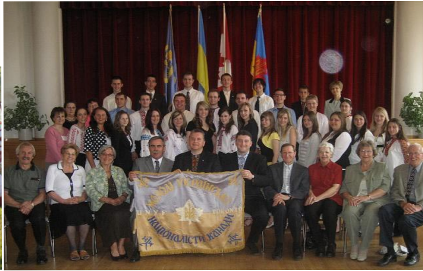
Members of the newly formed Edmonton MYHO at their First Annual Talent Show