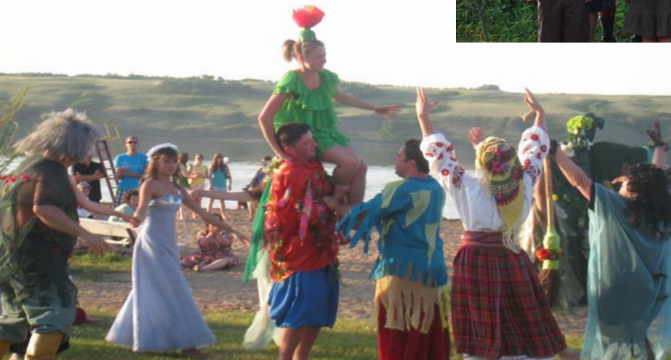
Festivities continue with independent drama theatre Suziria (left)