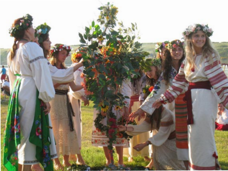
Girls dressed in traditional Ukrainian garb celebrate the day of Ivana Kupala