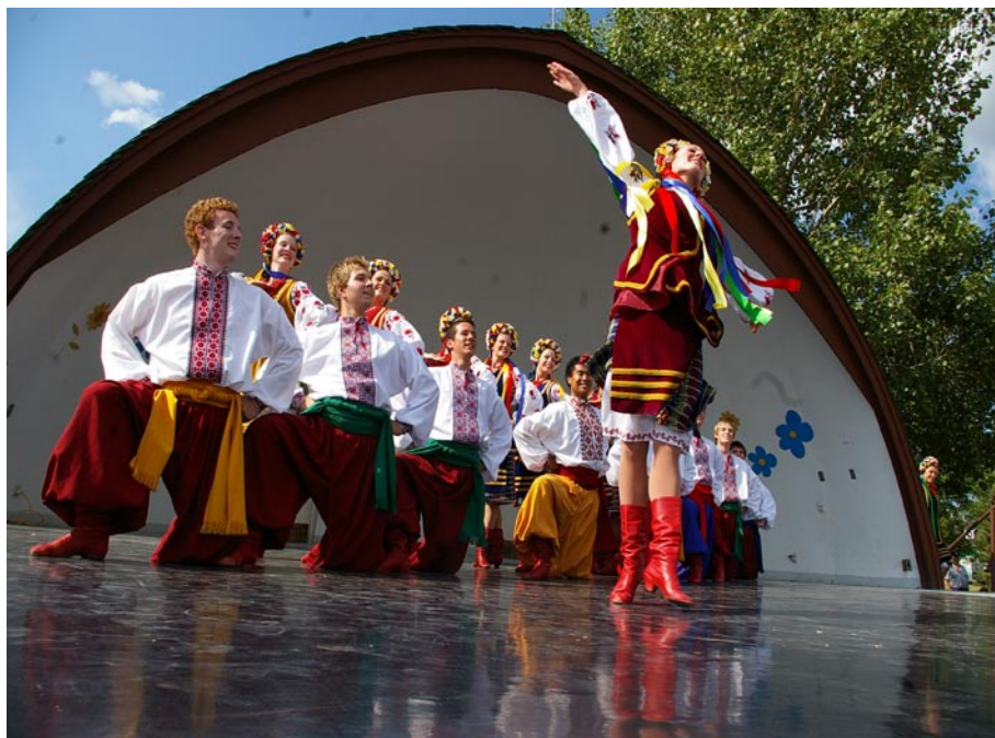
Shumka performs hopak at this years Ukrainian Day at the Ukrainian Cultural Heritage Village