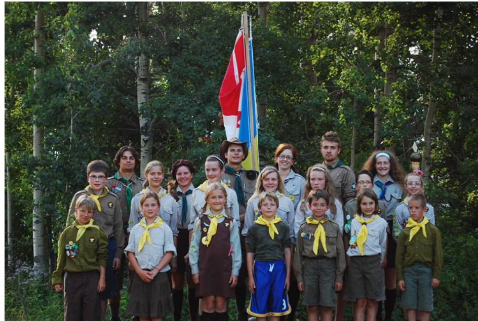
The morning dew sets over the tents of young Plastuny in Jasper National Park, AB (middle left)