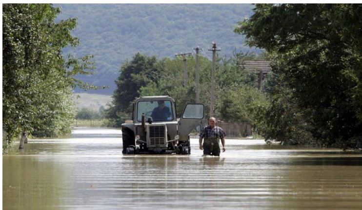
Tractor making its way along a flooded roadway in Ukraine (top); Ukrainian President Viktor Yushchenko leaves the home of a flood victim during his visit to the Ivano-Frankivsk region, close to the Romanian border. Heavy rains in western Ukraine have flooded large areas, leaving at least 13 people dead and forcing the evacuation of nearly 8,000 people. In the Ivano-Frankivsk region alone, some 21,000 homes are flooded (below)

Thank you for your generosity at this time of great need!