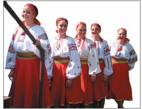
Verkhovyna Ukrainian Song & Dance Ensemble (Dunai Dancers)