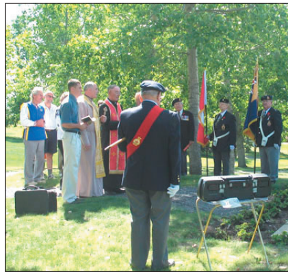
Memorial Service at the Royal Canadian Legion Monument honoring war veterans