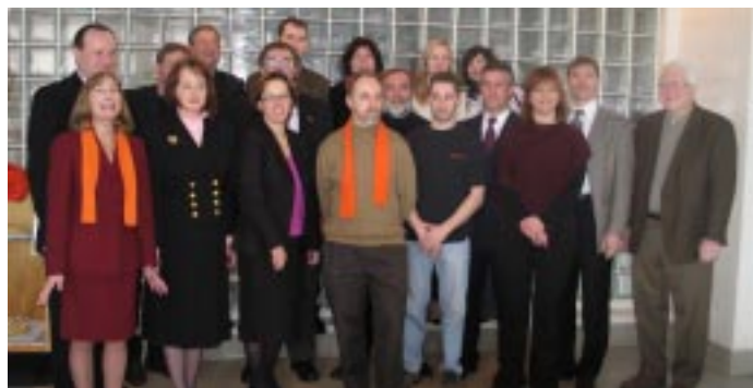
Pictured here are 18 of the 28 UCC-APC sponsored Election Observers at the Democracy Celebration and Community Update Meeting held on Feb. 6, 2005. For a complete list of Observers see page 6.