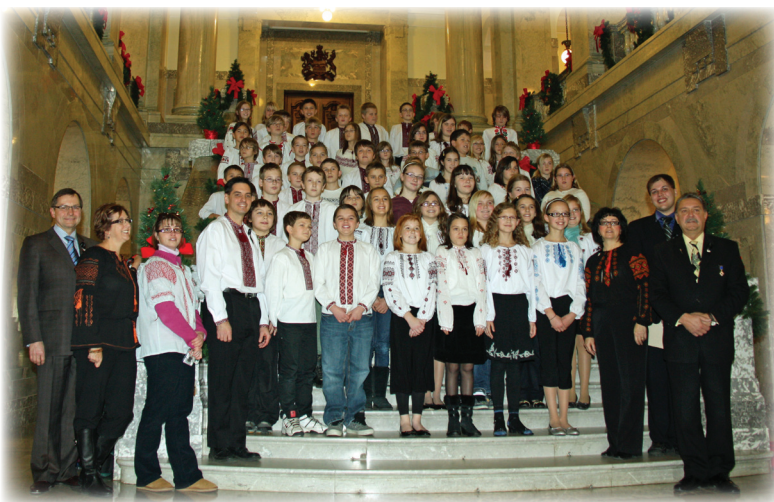
The Commemorative Event at the Alberta Legislative Assembly, November 2009

We developed promotional cards with a summary of our activities and an opportunity for individuals to sign up for our newsletters and e-Bulletin. They were available at community events along with the UCC-APC table display which was seen at the Heritage Day Festival, Vegreville Pysanka Festival, Ukrainian Day Festival, and Hetman Awards. Three printed UCC-APC Newsletters and a special edition for the Canada-Ukraine Business forum were prepared and mailed across Alberta. The UCC-APC Facebook page has been launched, where we have more than 100 friends, primarily youth. The UCC-APC website is updated regularly, and we have lots of activity with our on-line Alberta Ukrainian Community Events Calendar as well as the Ukrainian Day and Holodomor web-pages which are popular and attract regular visitors.