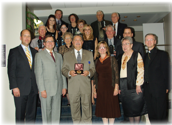
Нагородці з шановними гостями після церемонії Гетьманські Нагороди 2009 р.

Минулого року КУК ПРА поміняло своє лого, розпочало випуск електронного бюлетеня КУК ПРА та розробило інформаційні картки про нашу організацію. Наш дисплей був на Едмонтонському Фестивалі Дні Спащини, Вегревільському Фестивалі Писанка, Фестивалі Український День й Гетьманських Нагородах. Підготовлено й поширено в Альберті три друкованих Вісники КУК ПРА й спеціальний випуск до Канадсько-Українського Бізнес-Форуму. Відкрито сторінку КУК ПРА на Фейсбуці й регулярно оновлюється наш вебсайт.